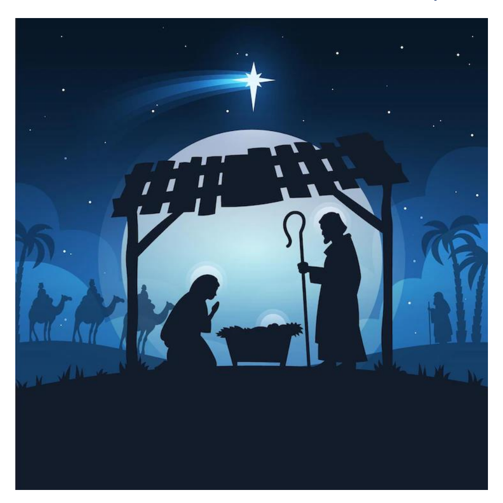
THE CATHEDRAL OF CHRIST THE LIVING SAVIOUR 368, Bauddhaloka Mawatha, Colombo 7