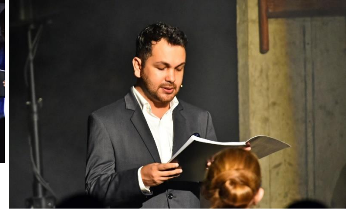
Journey of Promises 27th November 2022